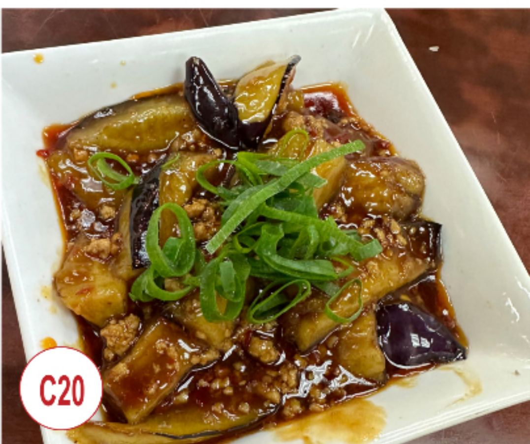
C20 魚香茄子飯 Eggplant with Salted Fish on Rice