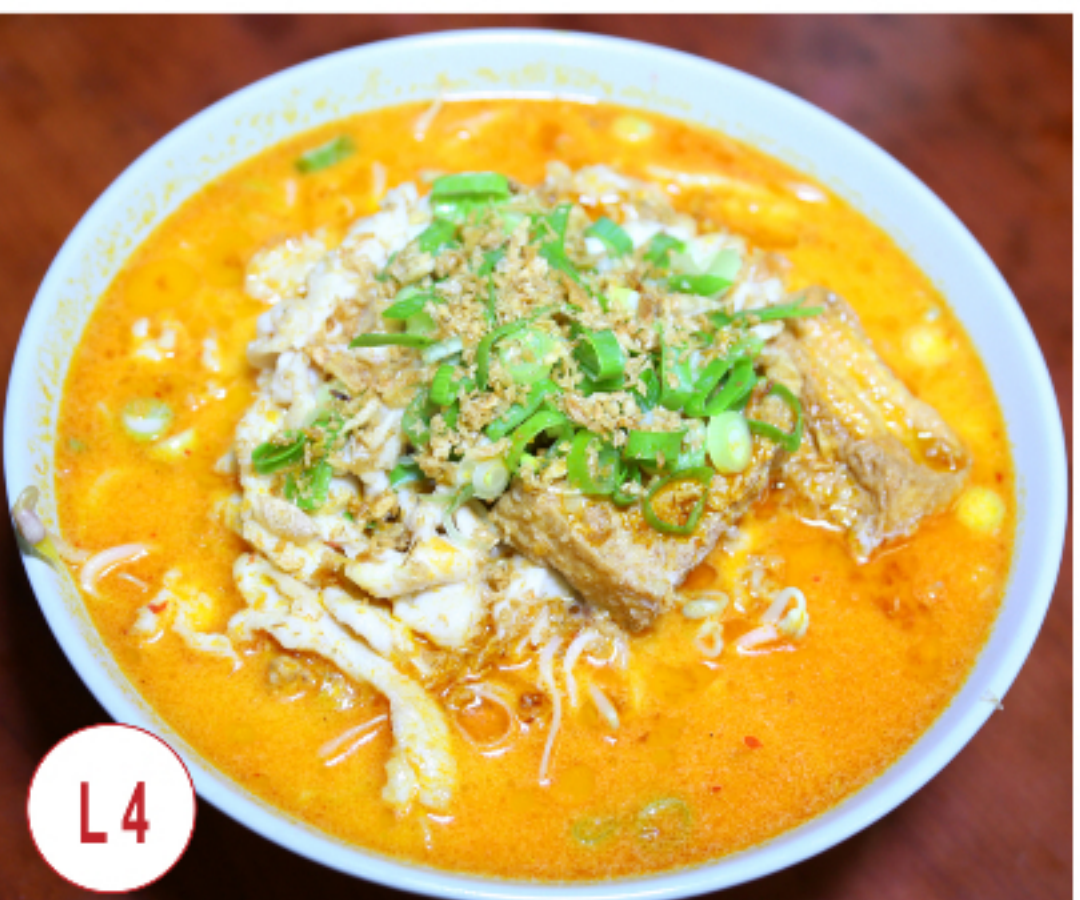
L4 雞肉喇沙 Chicken Laksa