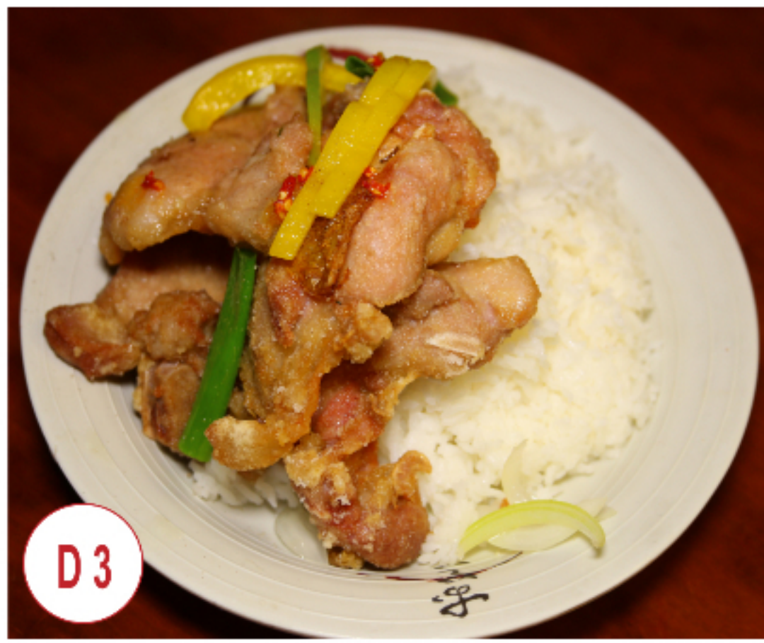
D3 椒鹽豬扒飯 Salted Pepper Pork Chop on Rice