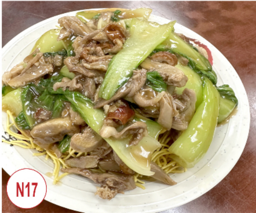
N17 菜遠鴨絲炒麵 Vege & Shredded Duck Noodle