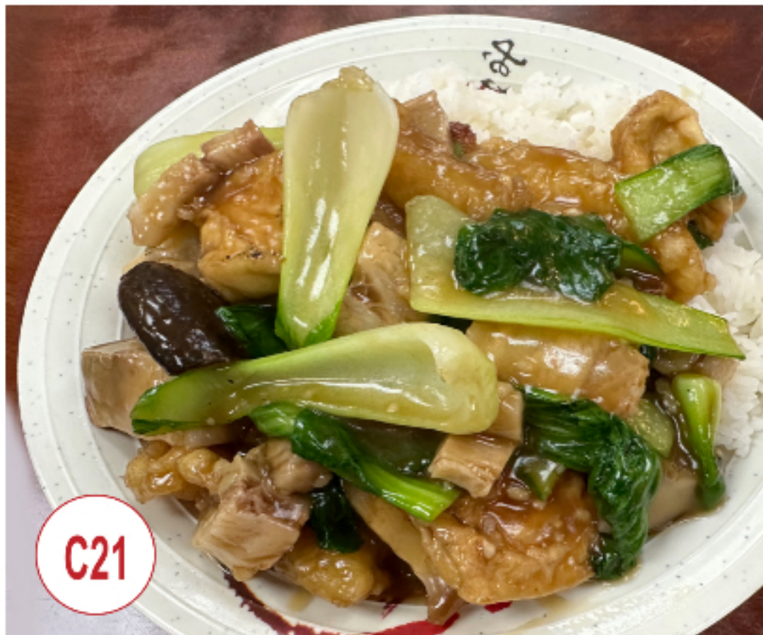
C21 豆腐班腩燒肉飯 To Fu with Roast Pork & Fish Fillet on Rice