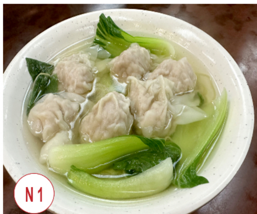
N1 鮮蝦雲吞 Prawn Wonton Soup