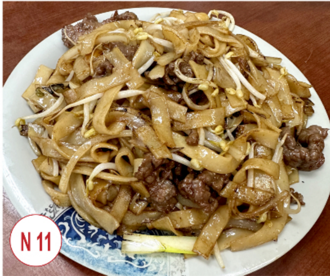
N11 干炒牛河 Stir Fried Rice Noodles with Beef