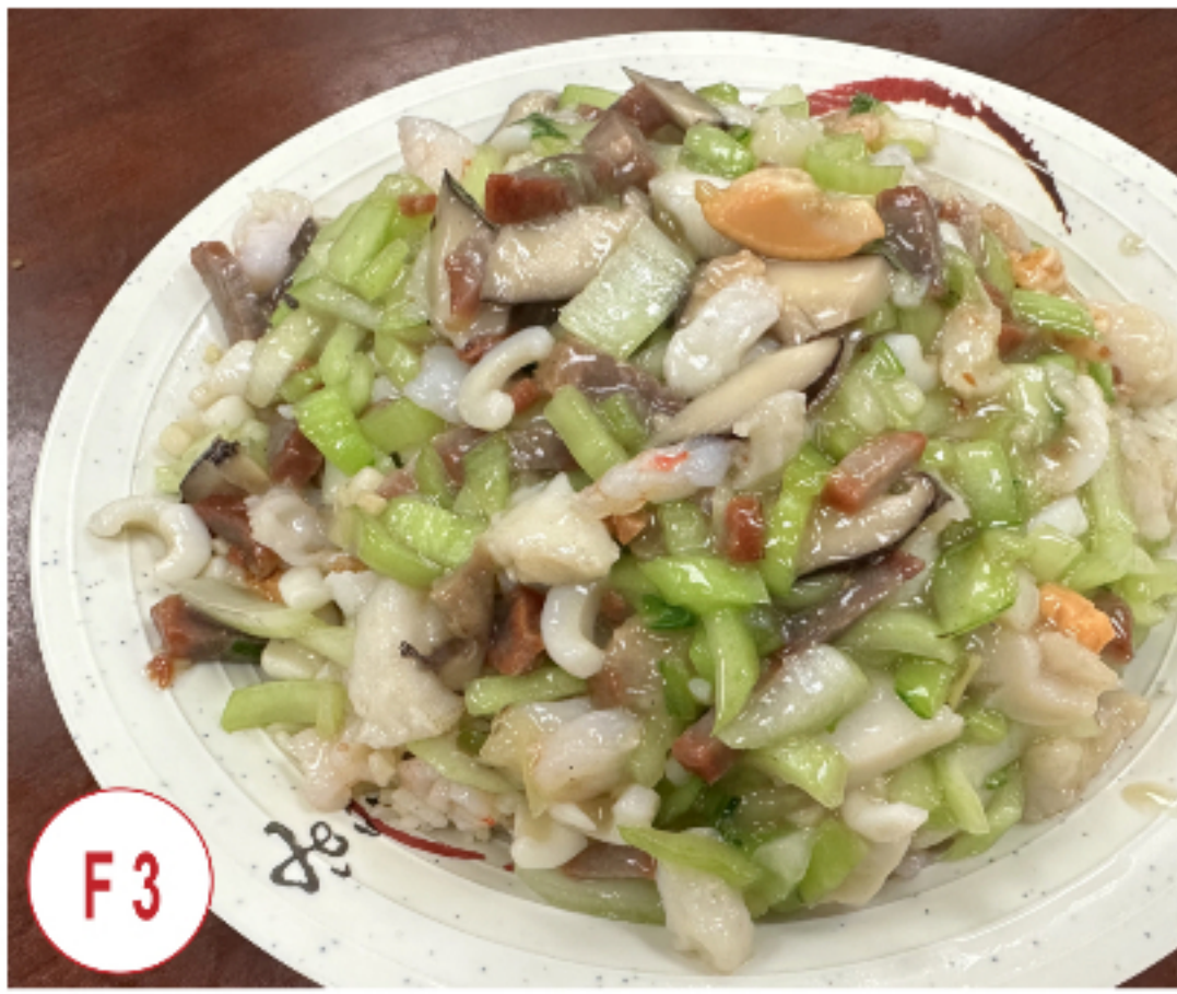
F3 福建炒飯飯 Fujian Style Fried Rice