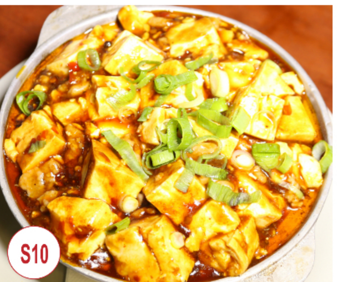
S10 麻婆豆腐煲 Mapo Tofu Hot Pot