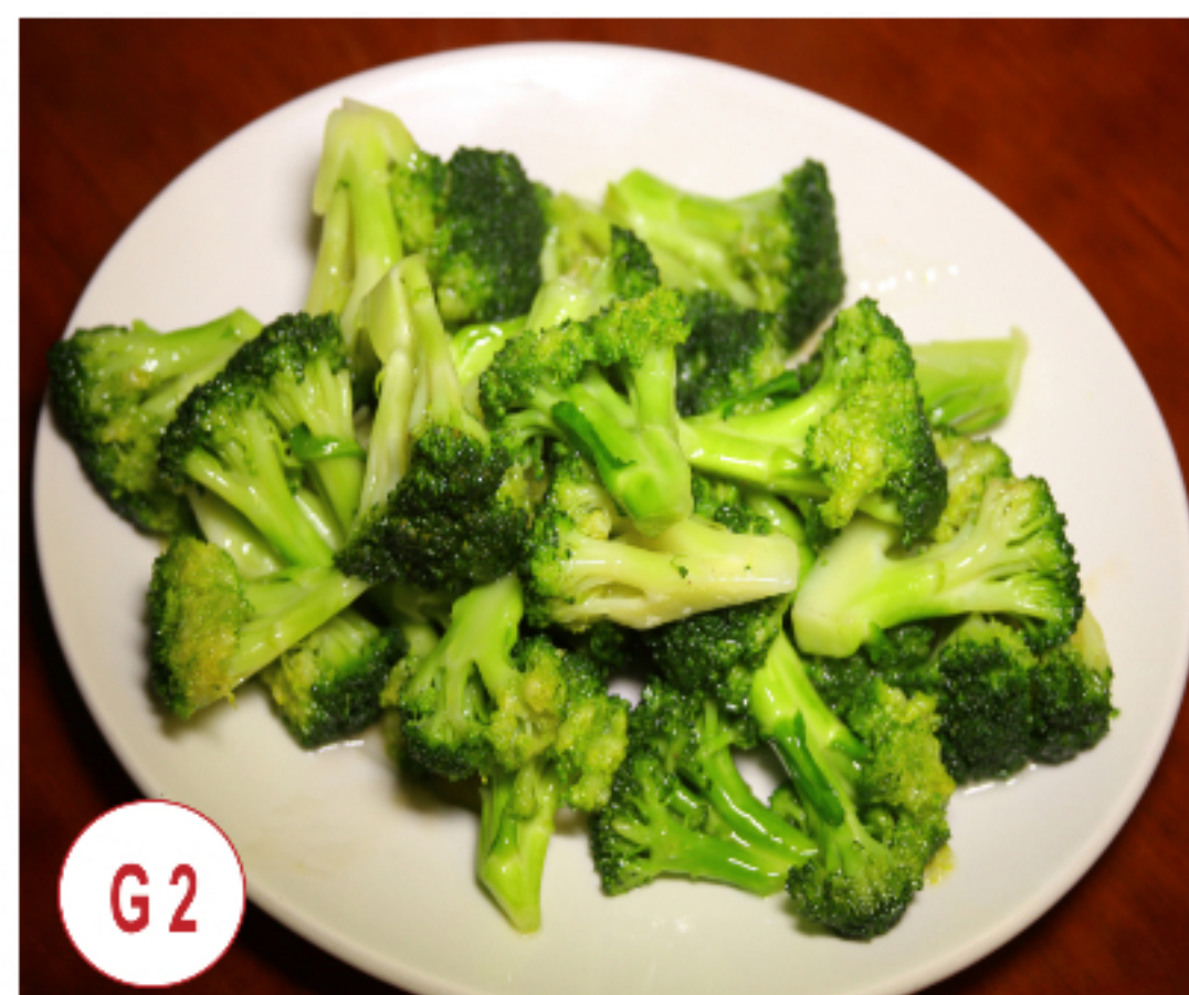
G2 蒜茸西蘭花 Broccoli on Garlic Sauce

OPENING HOURS MONDAY TO SATURDAY 11:30am TO 9:00pm (SUNDAY CLOSED) 營業時間 周一至周六 11:30am TO 9:00pm 周日休息