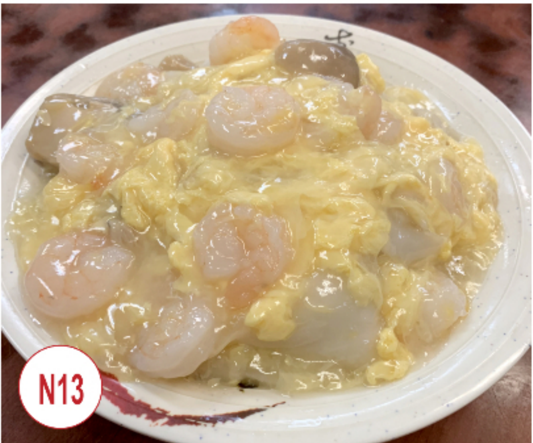
N13 滑蛋蝦河 Fried Rice Noodles with Gravy Egg with King Prawn