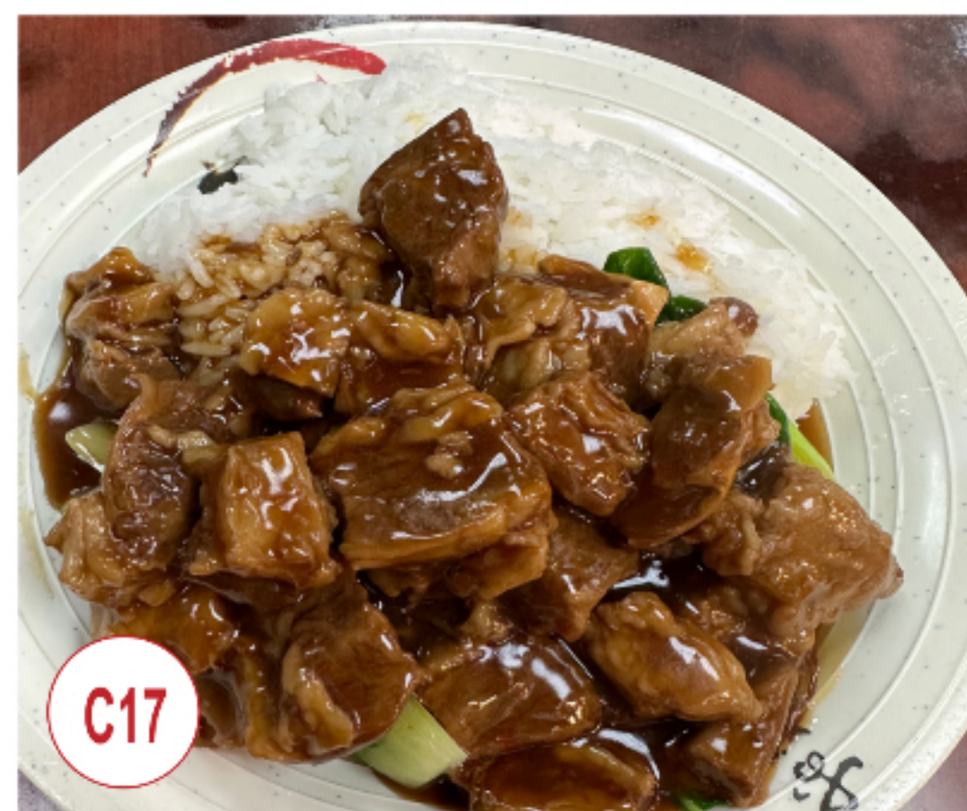
C17 牛腩飯 Beef Brisket with Rice