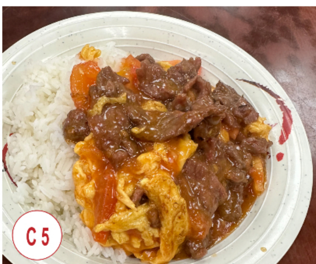
C5 鮮茄牛肉飯 Beef & Tomato on Rice