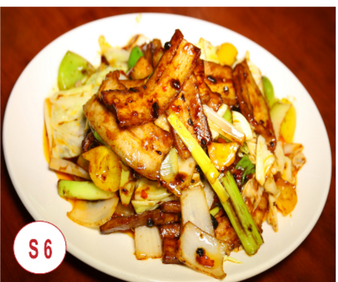
S6 正宗回鍋肉 Fried Pork in Sichuan Style