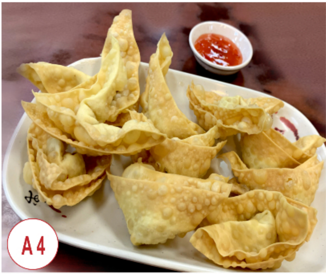
A4 炸雲吞 Deep Fried Wonton