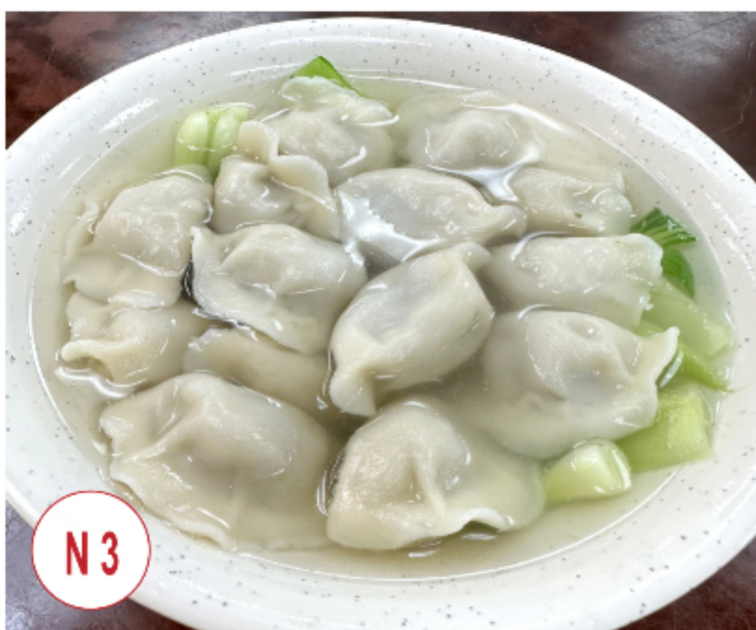
N3 韭菜豬肉水餃 Pork & Chives Dumpling Soup