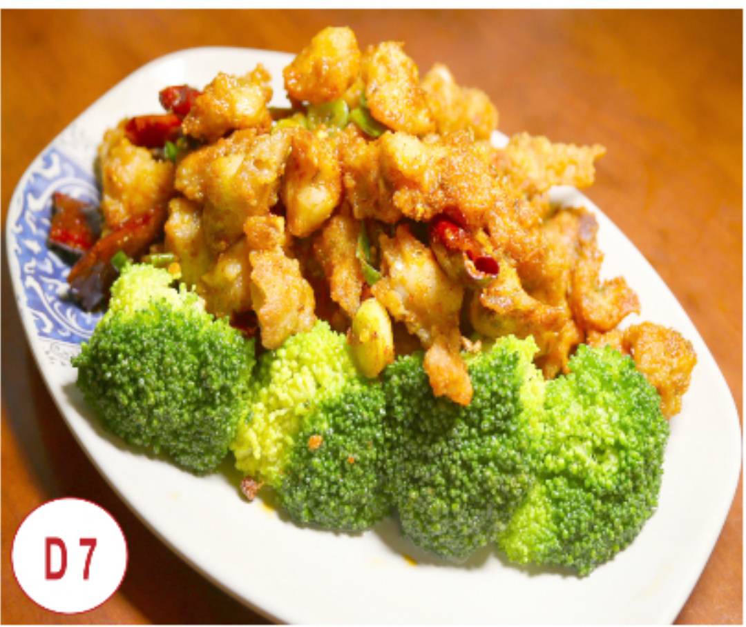
D7 孜然雞脆骨燴飯 Cumin Chicken Gristle with Rice