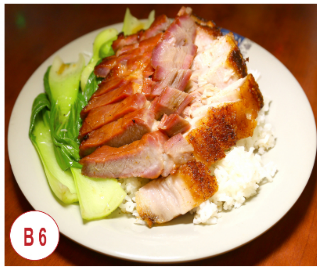
B6 燒味雙拼飯 Combination(2) of BBQ on Rice