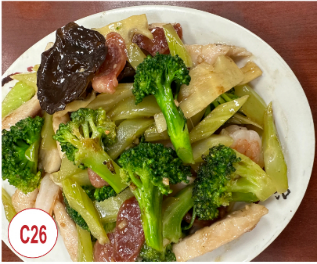
C26 客家小炒燴飯 Hakkas Sauteed Home Style with Rice