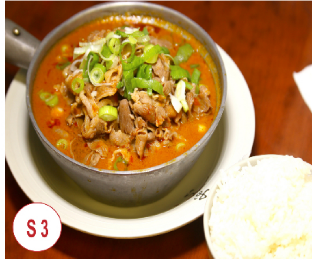
S3 香鍋小肥羊燴飯 Spicy Hot Pot Shredded Lamb with Rice