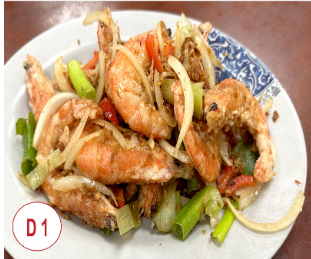
D1 椒鹽大蝦 Salted Pepper King Prawn