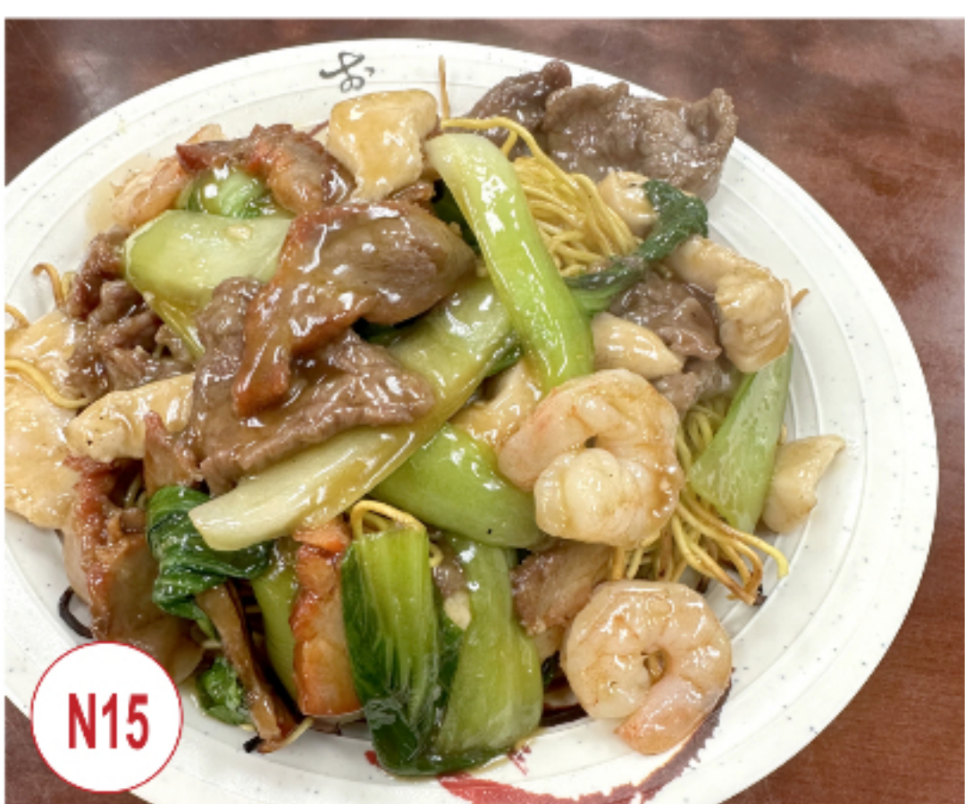
N15 什會炒麵 Combination Fried Noodle