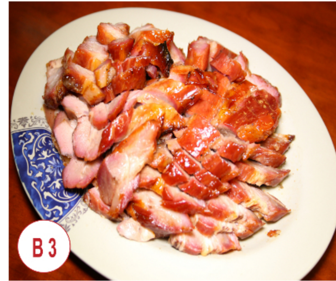
B3 蜜汁叉燒 BBQ Tender Pork