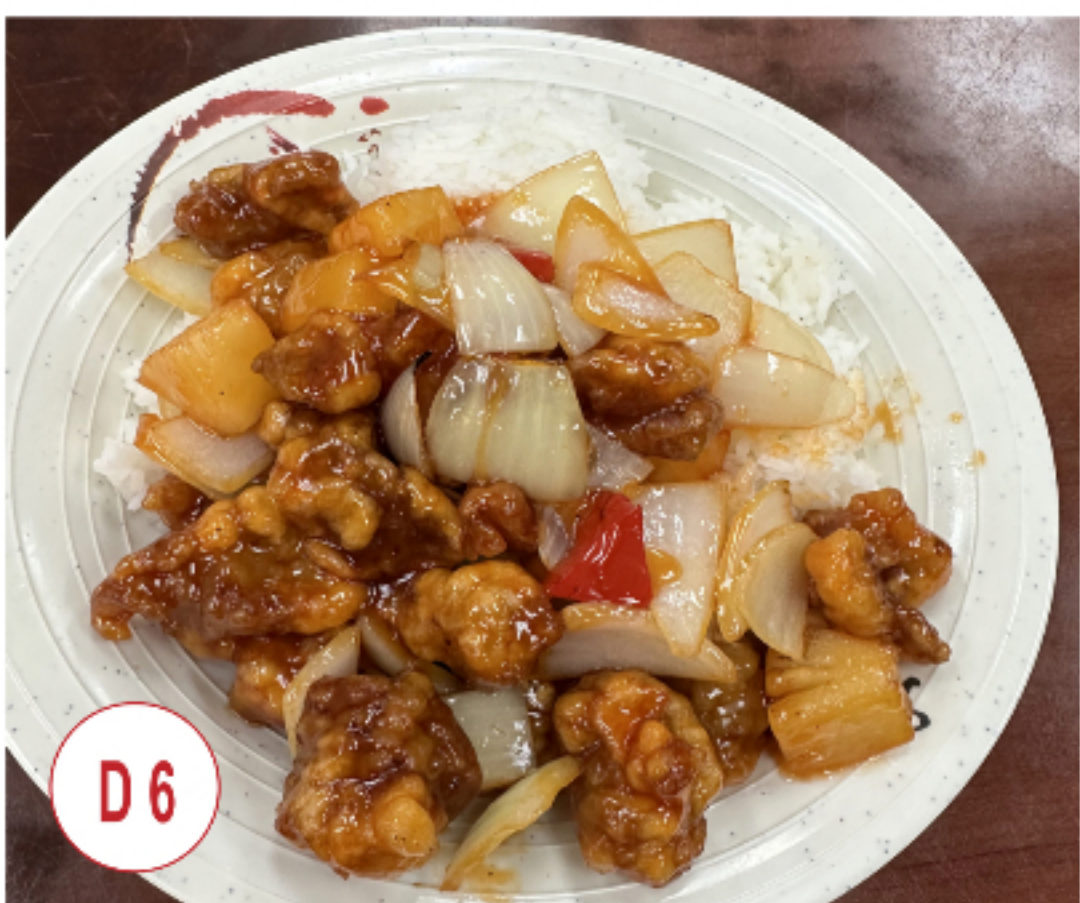
D6 咕嚕肉飯 Sweet & Sour Pork on Rice