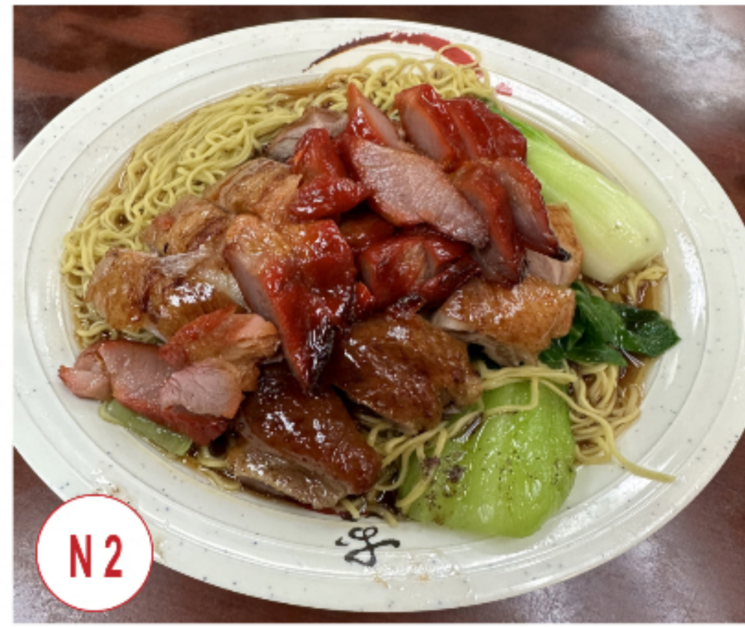
N2 燒味雙拼撈麵 Combination of Two Meats on Noodle