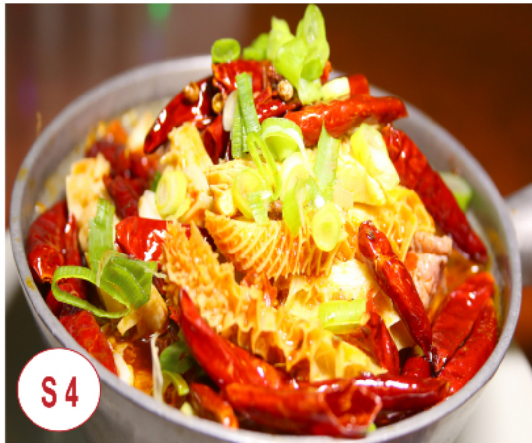
S4 潑鍋毛肚牛燴飯 Spicy Hot Pot Ox Tripe & Beef with Rice