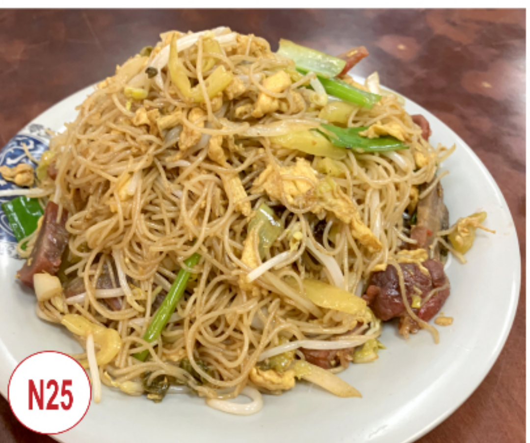
N25 星州炒米 Singapore Style Fried Vermicelli