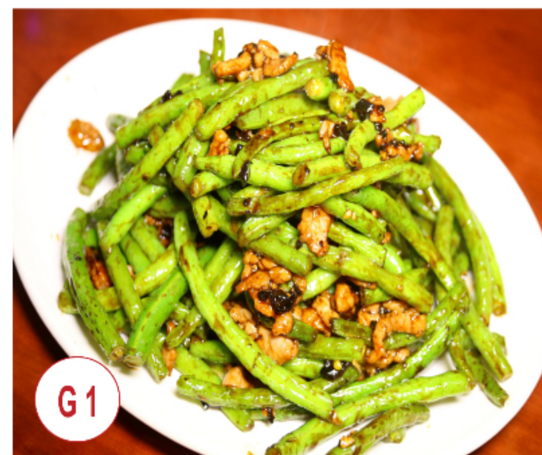
G1 干燒四季豆 Dry Fried Round Bean & Mince Pork