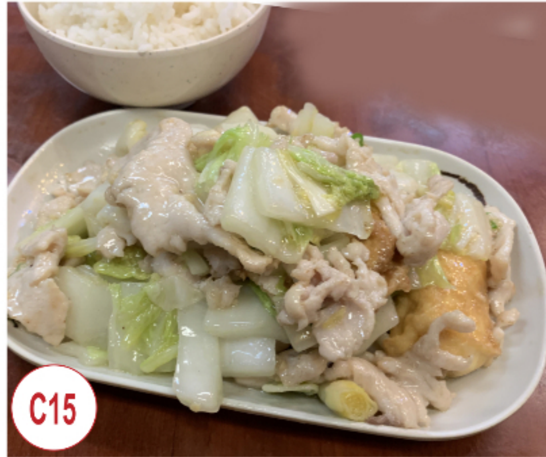
C15 豆腐黃牙白菜雞肉飯 Chinese Cabbage & Chincke with Rice