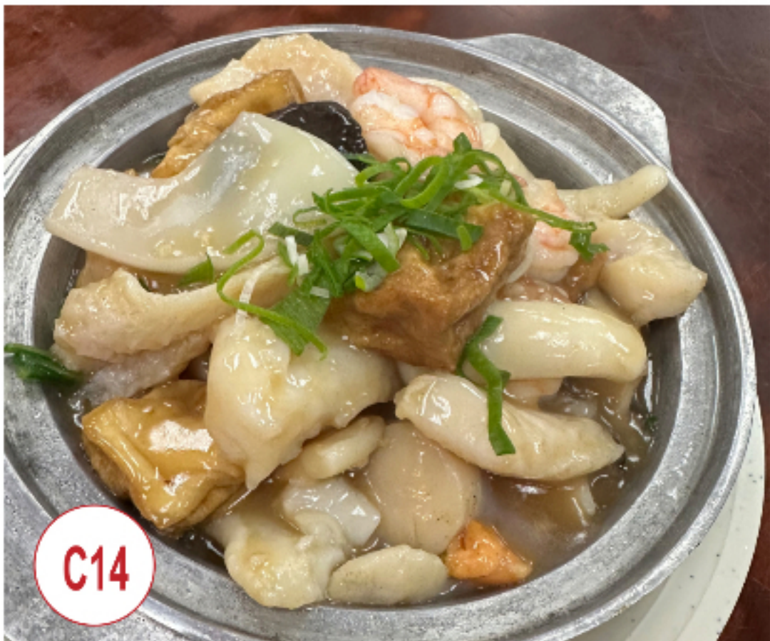
C14 翡翠海鮮煲 Seafood Tofu Hot Pot