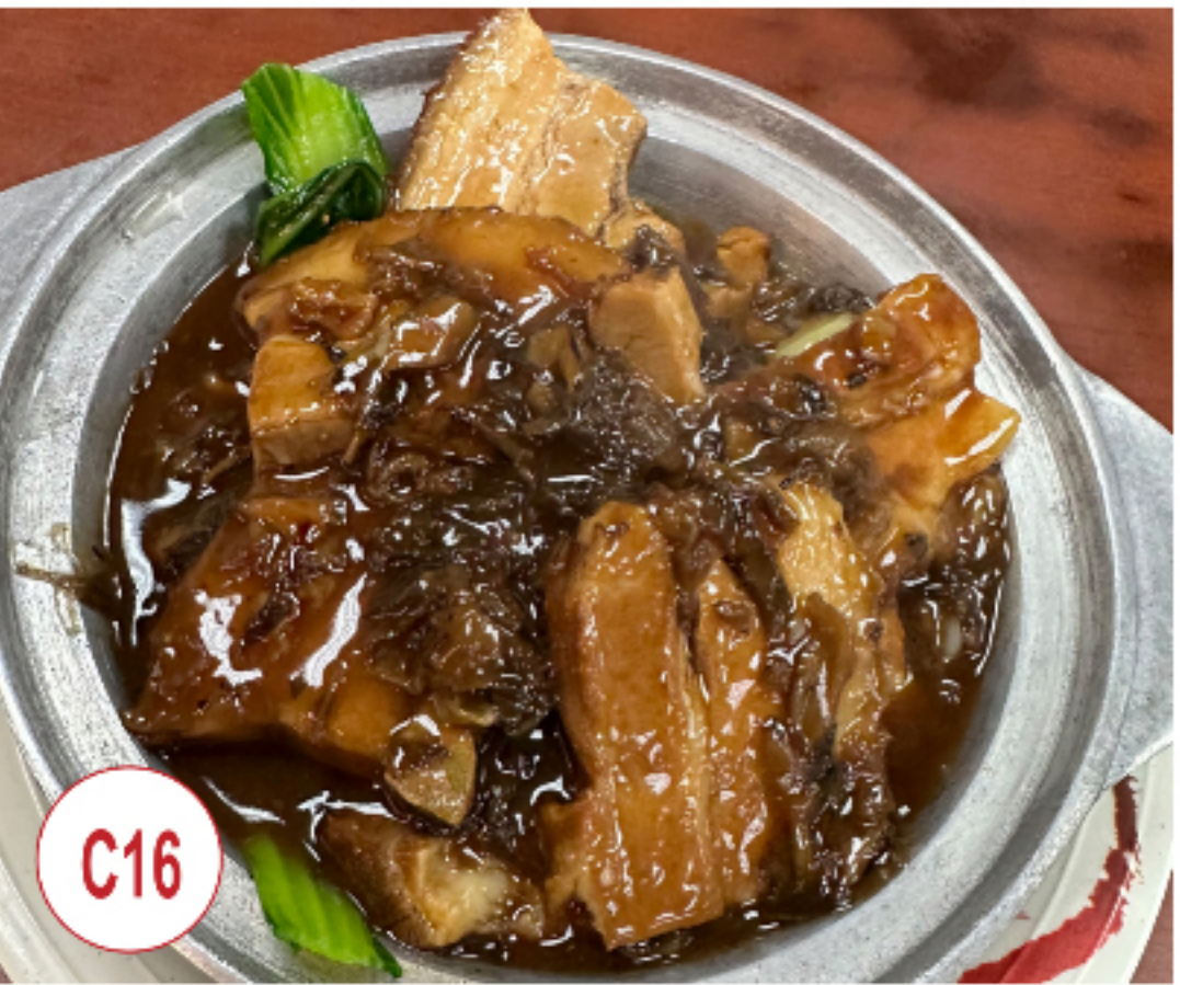
C16 梅菜扣肉煲 Pork Slice Marinade with Preserved Cabbage