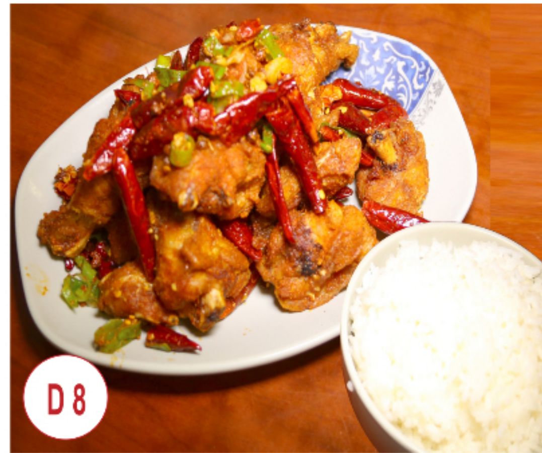
D8 歌樂山炸子雞燴飯 Geleshan Spicy Deep Fried Chicken with Rice