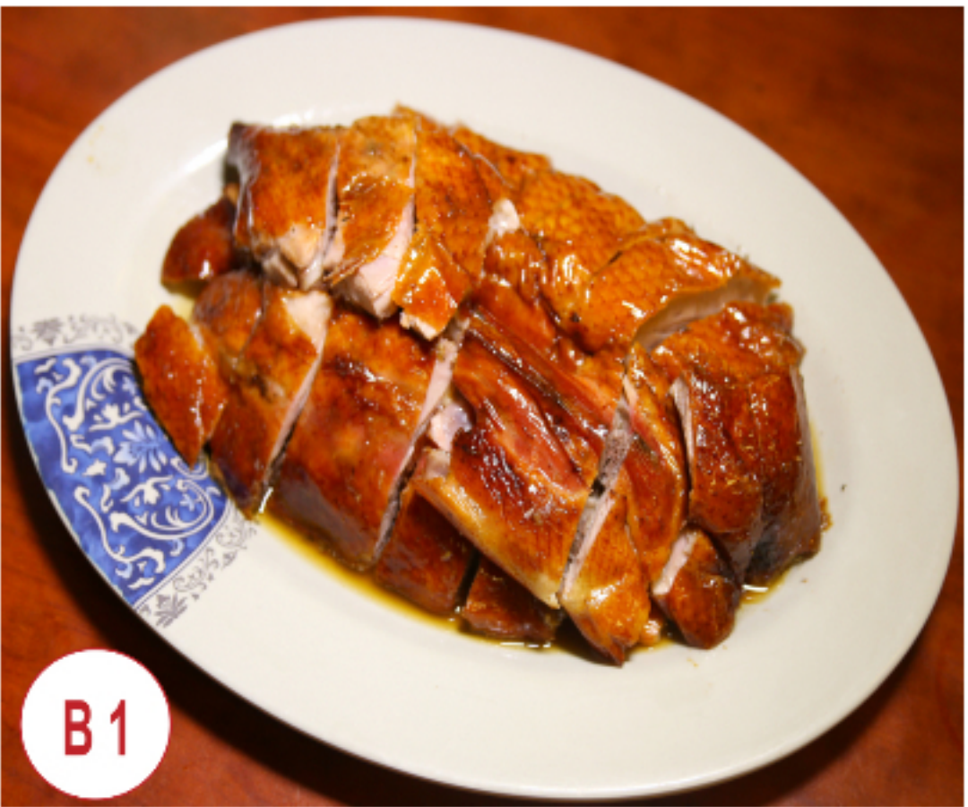
B1 KING 燒鴨 King Roast Duck