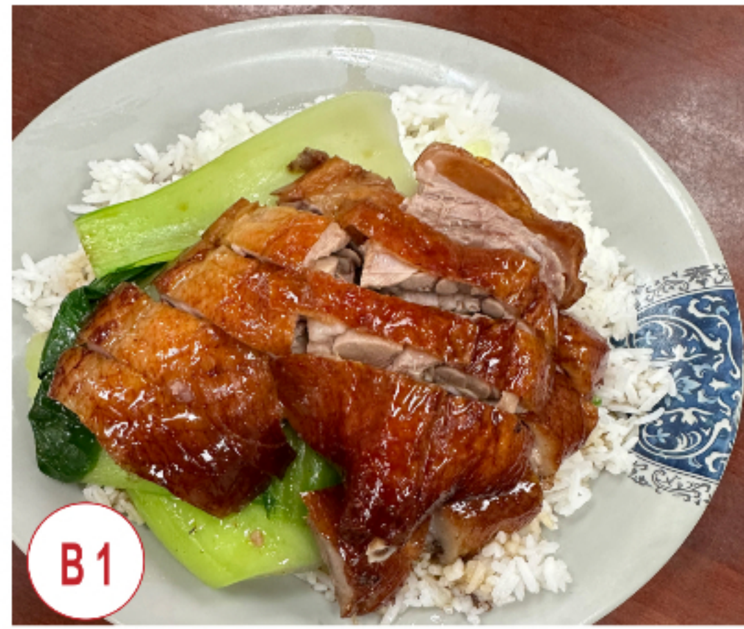
B1 燒鴨飯 Roast Duck on Rice