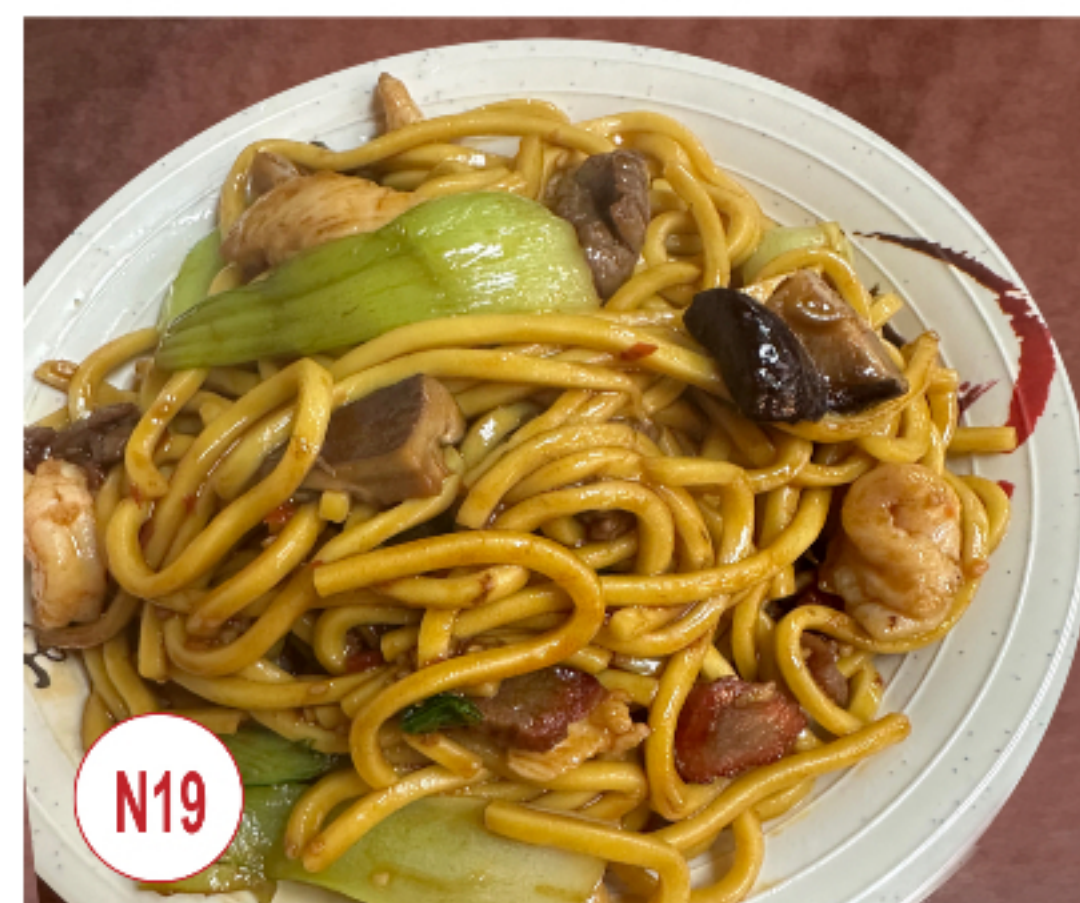
N19 福建粗炒 Fujian Style Fried Thick Noodle