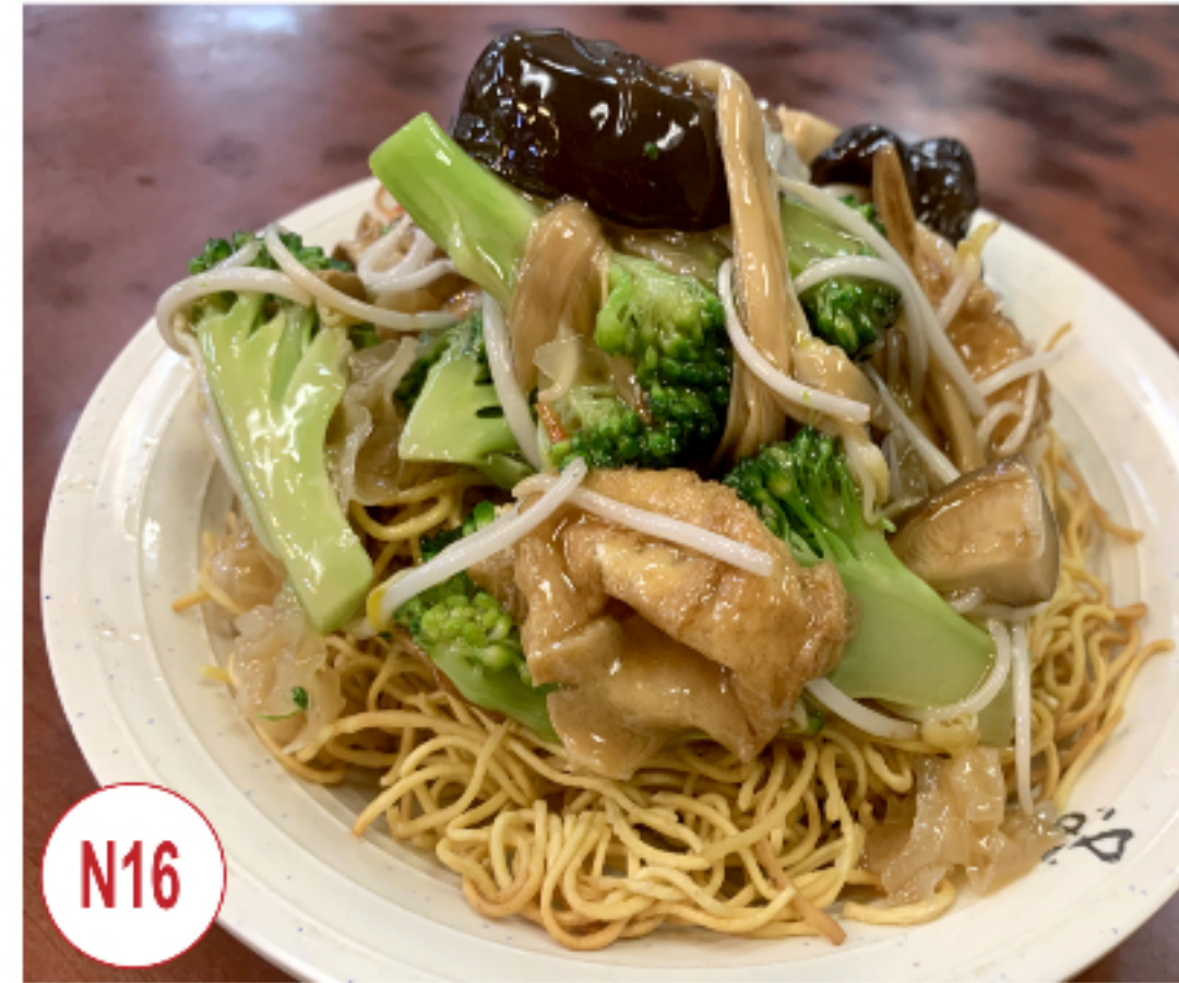
N16 羅漢齋炒麵 Vegetarian Fried Noodle