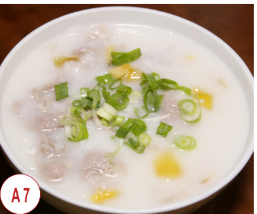
A7 皮蛋瘦肉粥 Pork & Preserved Egg Congee