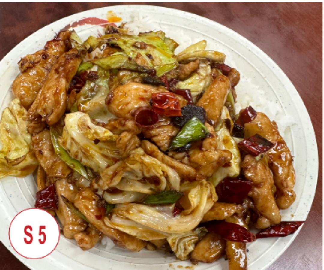
S5 四川雞柳飯 Sichuan Chicken with Rice