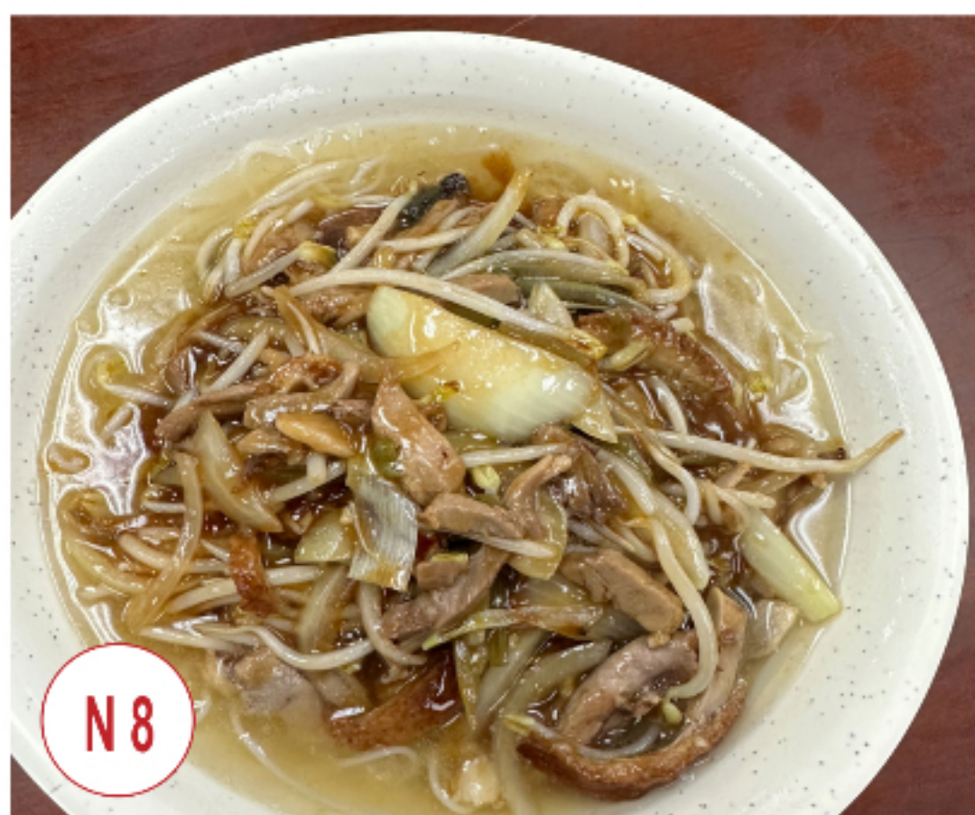
N8 雪菜鴨絲湯米 Pickled Cabbage & Shredded Duck Noodle Soup