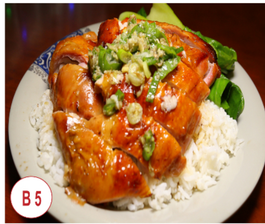
B5 燒雞飯 Red Roast Chicken on Rice