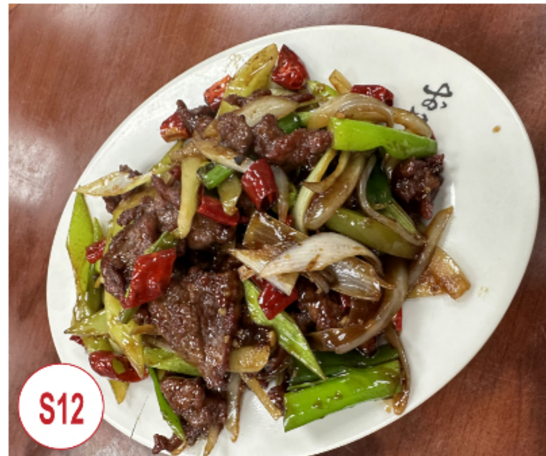
S12 干煸牛肉燴飯 Dry Flat Spicy Beef with Rice