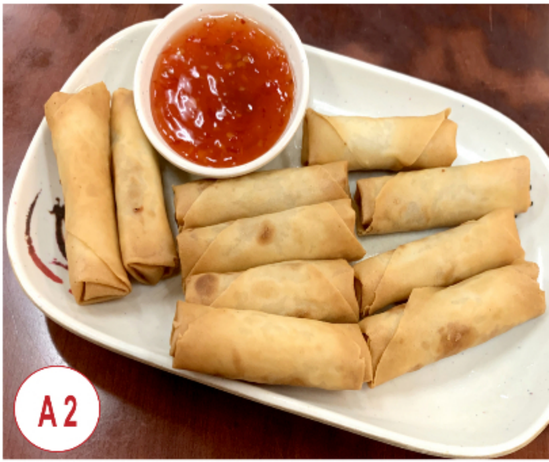
A2 蔬菜小春卷 Fried Vegetable Spring Rolls